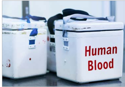
Timestrip® TIR can be used to monitor blood shipments.